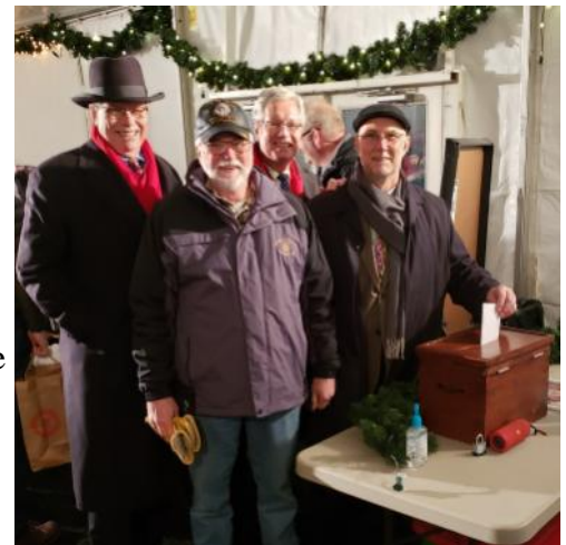
Depositing The Toys For Tots Check

Greetings from the East. Once again the holiday season is upon us. I wish each and every one of you a safe and blessed holiday season. Our Heritage dinner was a tremendous success. We had many people there including our Grand Master. On December 9 we made our presentation to Toys for Tots. We were able to assist the Marines in their effort this year to provide the children in the metro area a joyous Christmas. Our turkey dinner at the last stated meeting was enjoyed by all and we had a