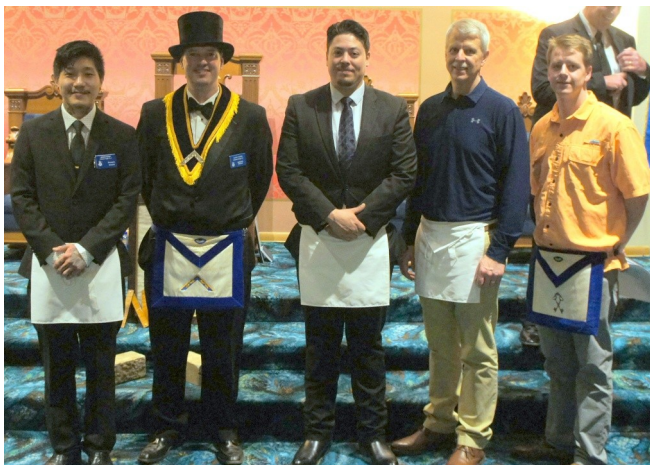
Cataract No.2 New Master Masons