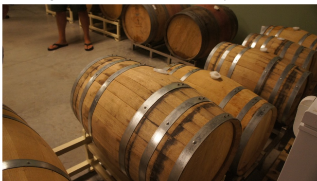
Only dark beers are aged in these wine and spirits kegs. Most should be imbibed within three months.