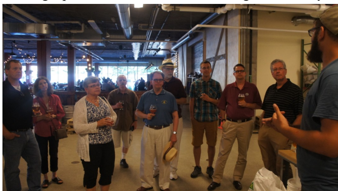
We learn about the chemistry of brewing beer the Belgian way. We were offered Hops to taste.