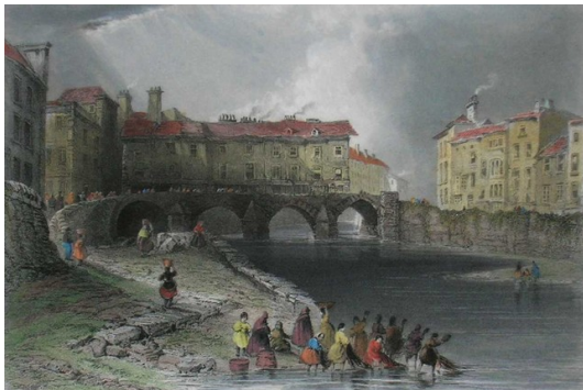
Old Baal's Bridge, Limerick c. 1830.