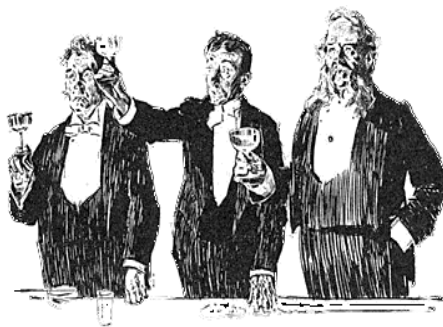
The Tyler's Toast!

Join us for the annual Cataract Lodge No. 2 Heritage Festival and Awards Night as we honor the long time members of the lodge. Award recipients and a guest are guests of the lodge. Everyone else, tickets are $25.00 each.