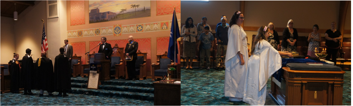
Demolay carried our Nation's Flag and Jobs Daughters the Holy Bible